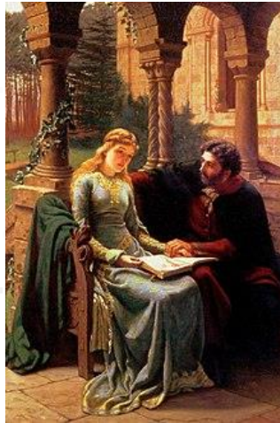
Heloise d'Argenteuil and Peter Abelard